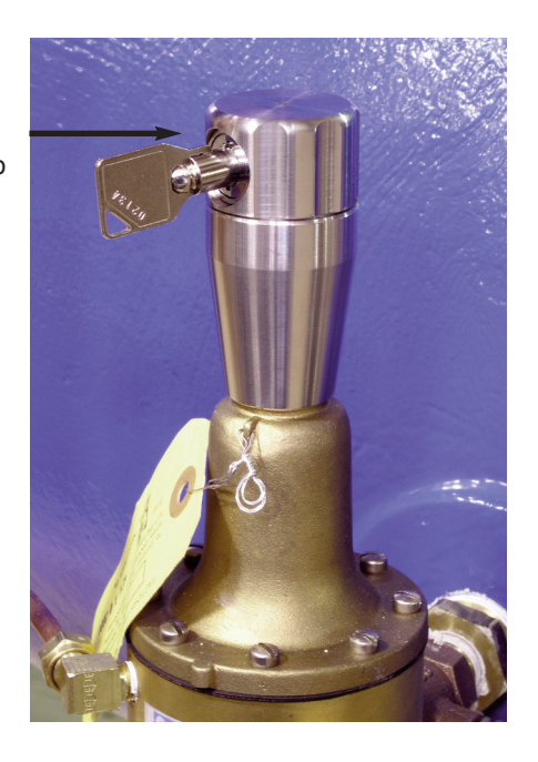
X140-1 Locking Security Cap